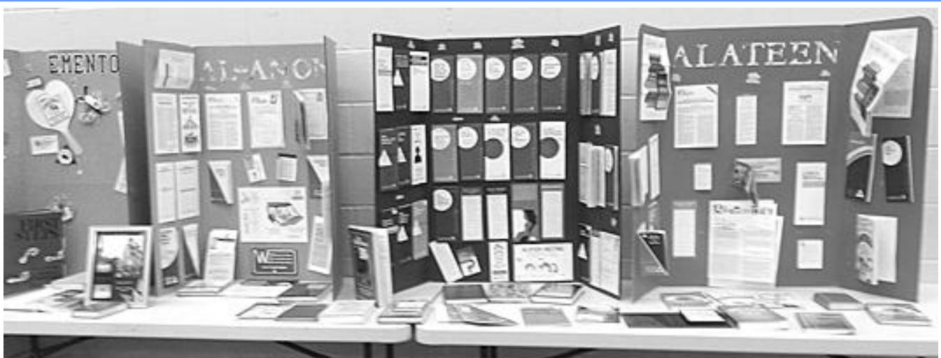
Tally's Archival Display ~ District 6 Meeting, January, 2012

Al-Anon / Alateen Archives * Our History Lives ON!