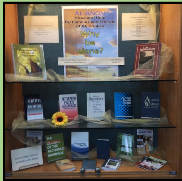
Al-Anon CAL Display

We've also been involved with some public outreach activities; the photos on this page show the display our group placed in the San Marcos Public Library during the month of September as part of our outreach to the community. This was the second year we provided this information.